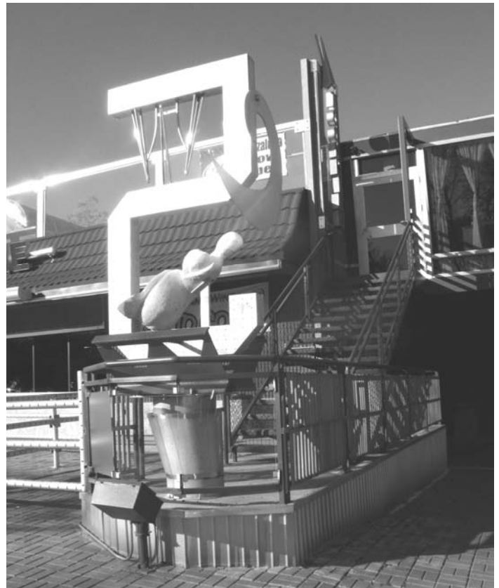
Armour Hills' only restaurant is open at Gregory Boulevard and Rockhill Road. The restaurant is adorned with an unusual art sculpture of a mezzaluna or “half moon.”